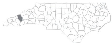
HAYWOOD COUNTY, NC

This study measures the economic impacts created by HCC on the business community and the benefits the college generates in return for the investments made by its key stakeholder groups—students, taxpayers, and society. The following two analyses are presented: